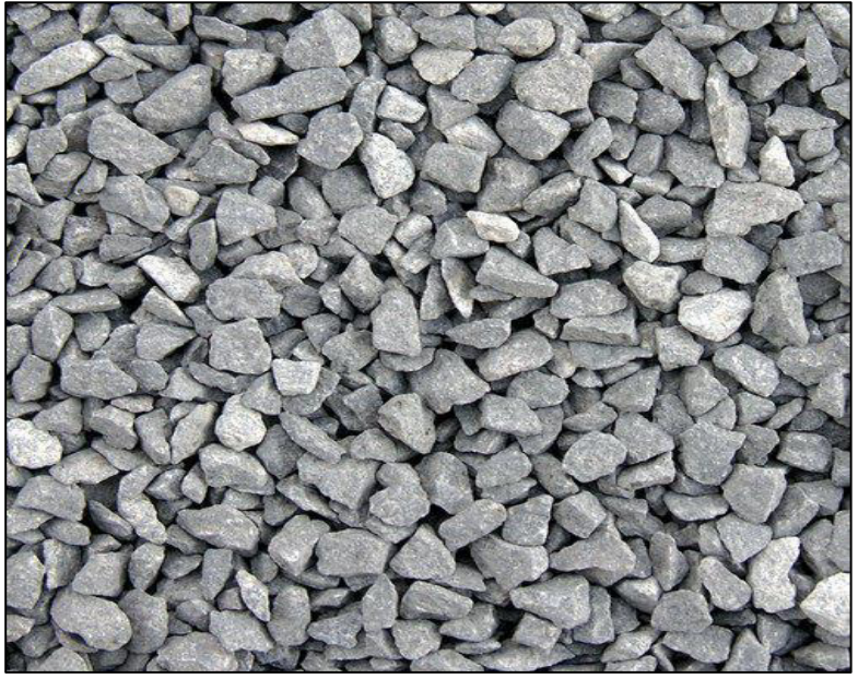
Fig. no. 3 Natural Aggregates

|| Volume 11, Issue 1, January 2022 || | DOI:10.15680/IJIRSET.2022.1101107 |