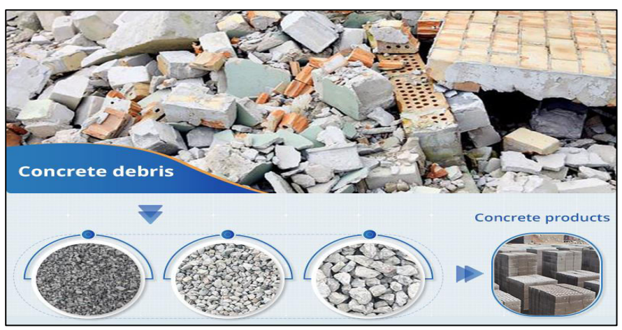
Fig. no. 1 Recycled Aggregate Concrete Formation