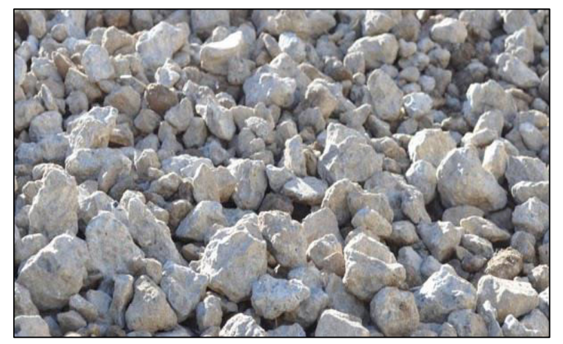
Fig. no. 2 Recycled Aggregates